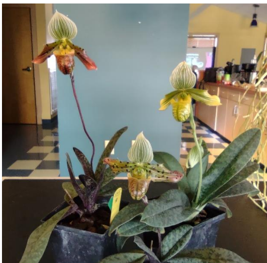
Some Paphiopedilum venustum Eron brought for show and tell.